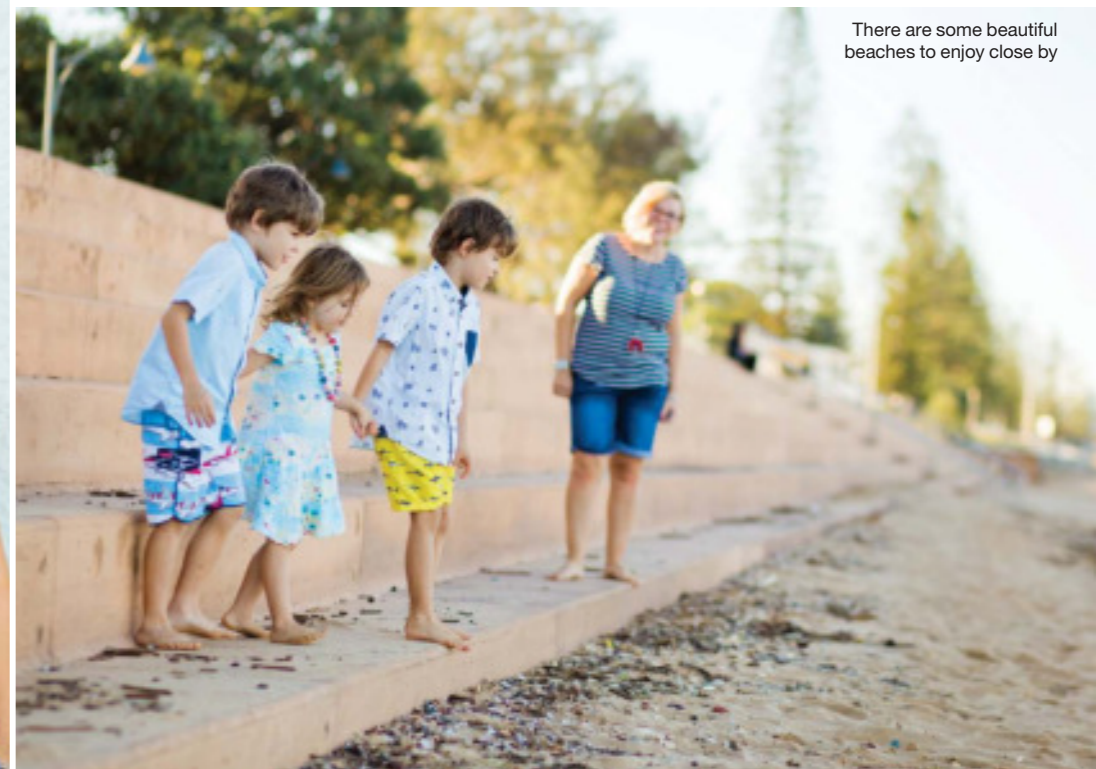
There are some beautiful beaches to enjoy close by

If you are heading Down Under to start a new life and are willing to share the story about your move with us, we would love to hear from you! Simply email us at editor@australiamagazine.co.uk