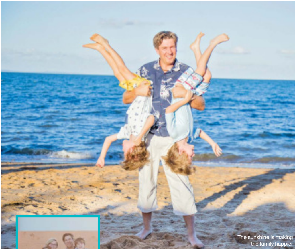
The sunshine is making the family happier