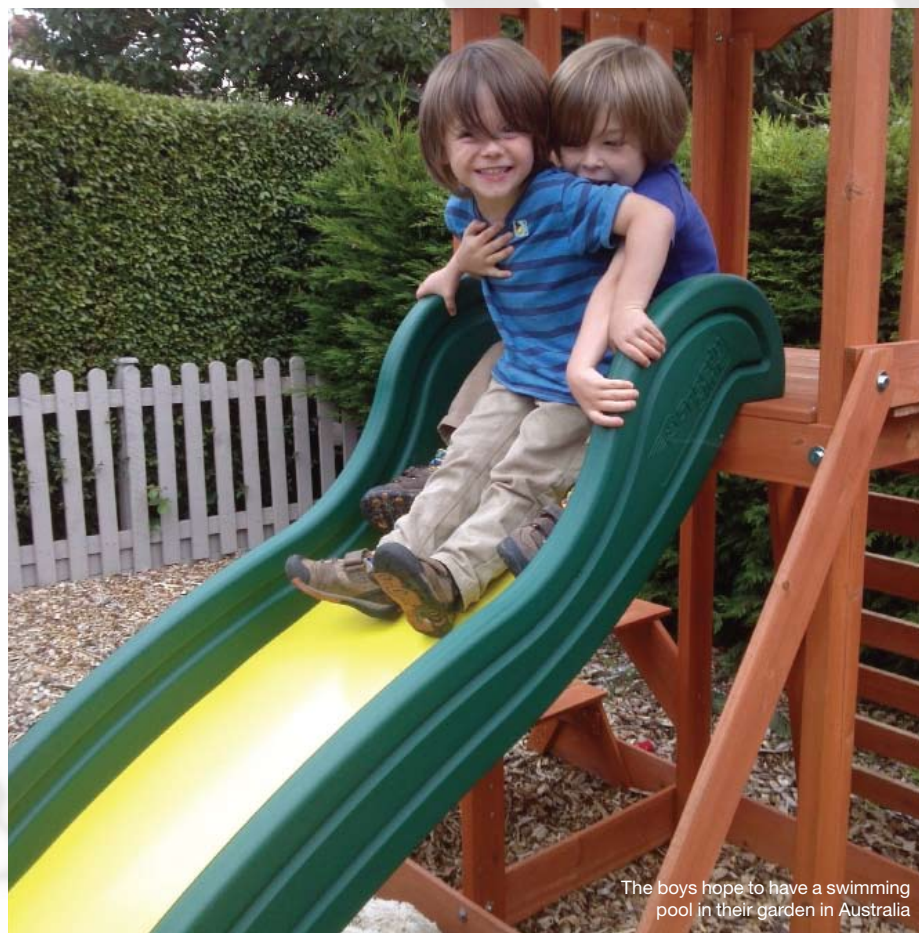
The boys hope to have a swimming pool in their garden in Australia

M ummy, can Zachary come to play when we move to Australia?" asked one of my four-year-old twins this week about their best friend.