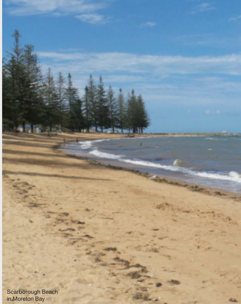
Scarborough Beach in Moreton Bay

Business services account for more than one-quarter of the Brisbane economy. It's the largest employing sector in Brisbane and a large proportion of the highly skilled professional workers are