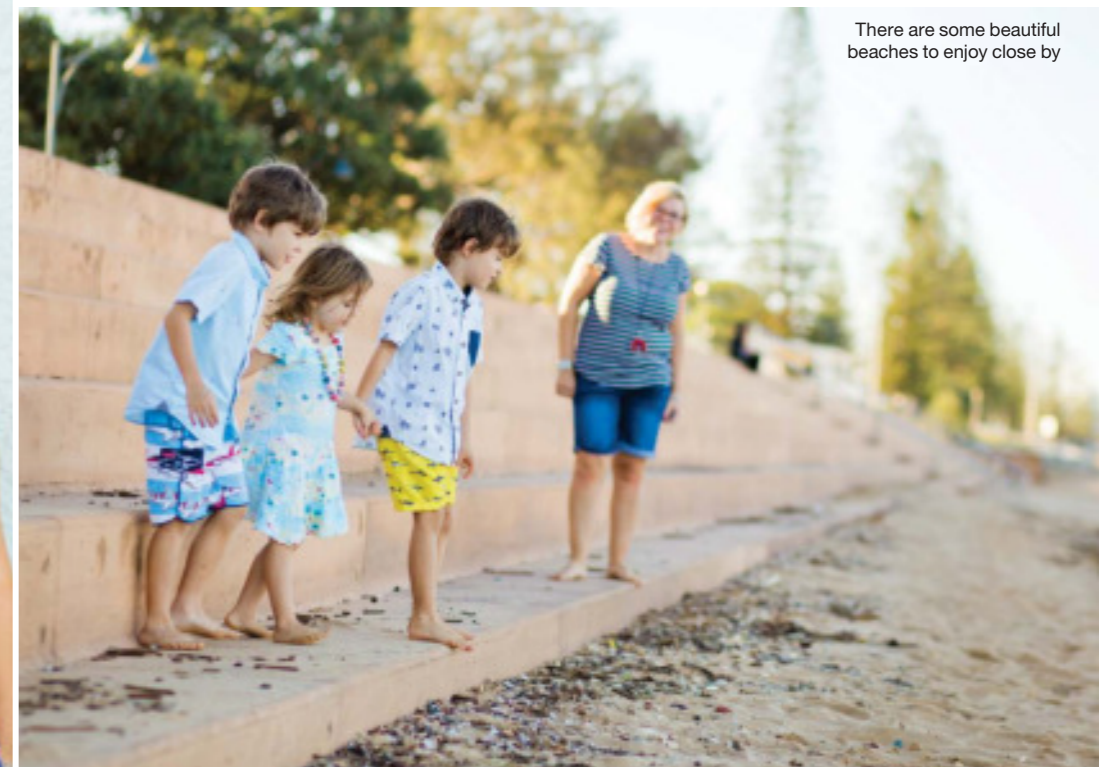
There are some beautiful beaches to enjoy close by

If you are heading Down Under to start a new life and are willing to share the story about your move with us, we would love to hear from you! Simply email us at editor@australiamagazine.co.uk