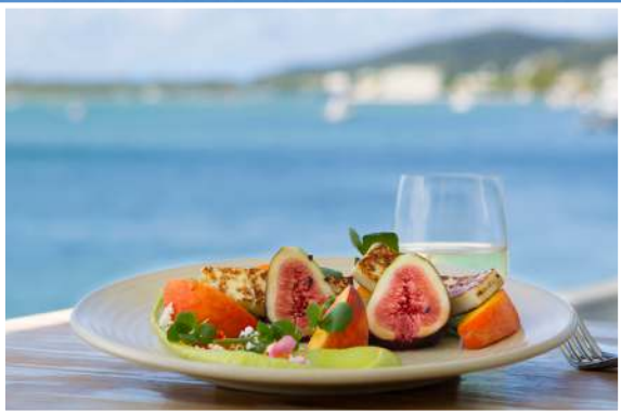
Left: Fresh fruit platters and to-die-for views at Noosa Boathouse