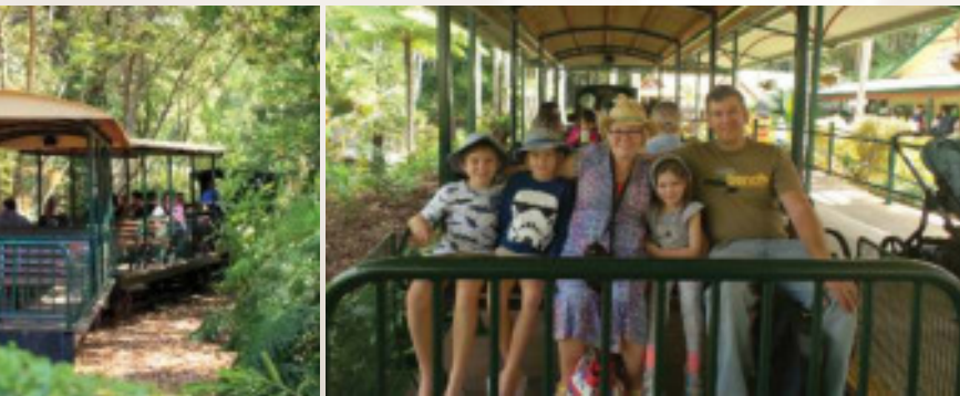
Above (left and right): A ride on the Ginger Train offers a fun way to explore the Ginger Factory's surroundings

“We begin by hopping aboard the Ginger Train – a train used in the Moreton Sugar Mill”