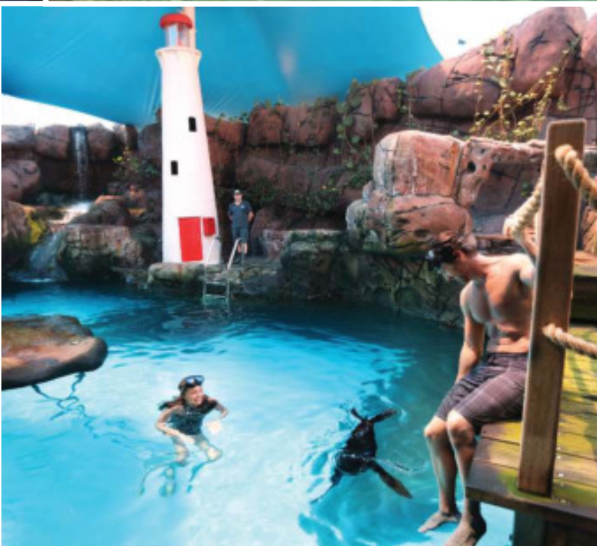
Clockwise from above left: Al fresco dining at Alex Heads Surf Club; Sunshine Castle in Bli Bli; waterslide fun at BreakFree Alexandra Beach resort; a seal show at Sea Life Sunshine Coast