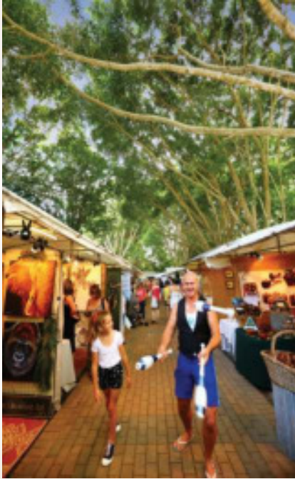
Top left: Colourful stall at Eumundi Markets; and (above) a street performer entertains shoppers

“We begin by hopping aboard the Ginger Train – a train used in the Moreton Sugar Mill”