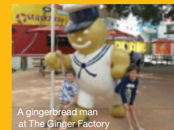
A gingerbread man at The Ginger Factory

The Mary Cairncross Scenic Reserve Discovery Centre ( www.mary-cairncross.com.au ) is an amazing learning resource with plenty of walking tracks.